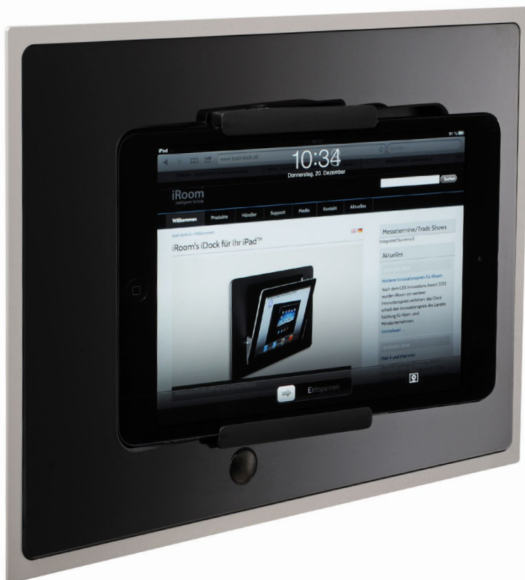
iPad mini® Docking Station